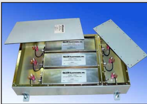
Multi line filters installed in a cabinet

LCR Electronics EMI filter capabilities can help your products meet all requirements and achieve "Mission Success" in the ultimate application. We are a uniquely integrated company for advanced design, engineering, manufacturing, testing and technical support.