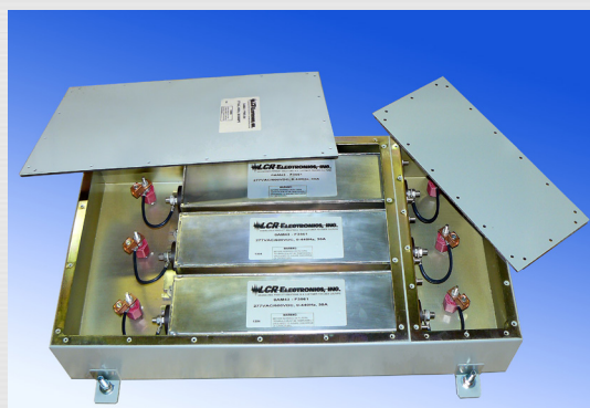
Multi line filters installed in a cabinet

LCR Electronics EMI filter capabilities can help your products meet all requirements and achieve "Mission Success" in the ultimate application. We are a uniquely integrated company for advanced design, engineering, manufacturing, testing and technical support.